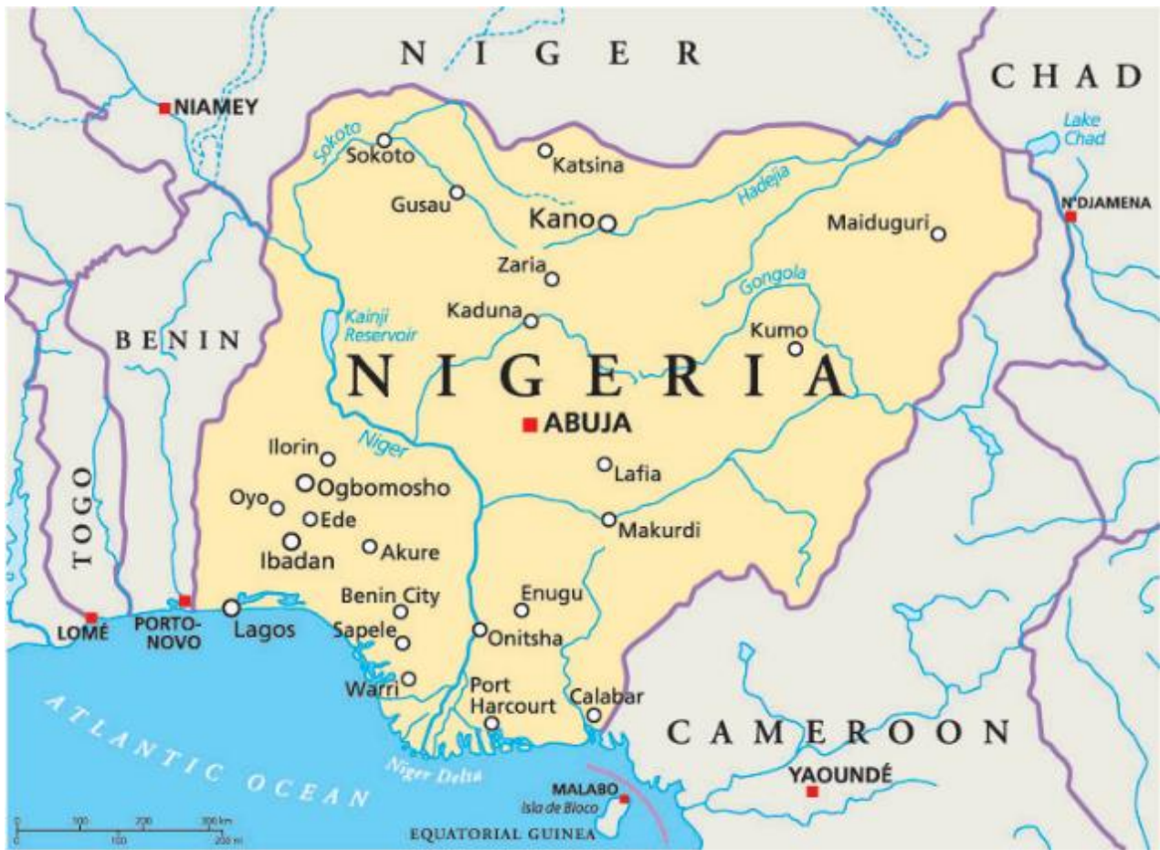
Figure 3: Nigeria - location 11

Lagos is Africa's most populous city, with about eight million inhabitants, and the cities of Ibadan and Kano (both with around three million inhabitants) are among the continent's 10 most populated cities. 9 The urban-rural mix of the population is fairly even, with an estimated 53% living in rural areas in 2014. 10