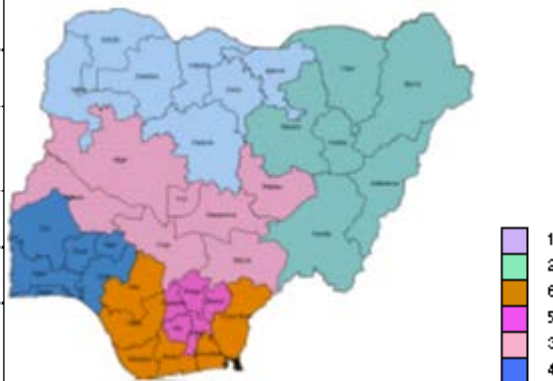
Figure 4: Nigeria - Zones and States 12