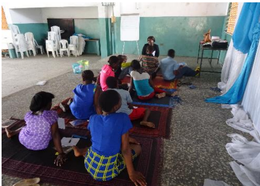
Figure 1 Group work with children.

Interviews with children and young people were conducted as group activities, except in the case of an individual interview with an adult care leaver. A standard set of questions was used, varied according to age and time available. Although the questions were asked by the medium of group discussions, in each session we included a confidential activity in which children/young people were invited to write on coloured 'post-it' sheets things they were happy about (yellow post-its) and things they were sad or unhappy about (pink post-its).