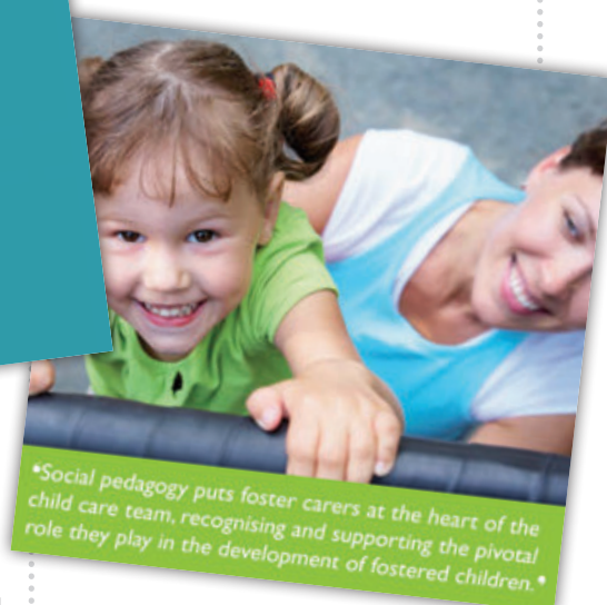
*Social pedagogy puts foster carers at the heart of the child care team, recognising and supporting the pivotal role they play in the development of fostered children.*