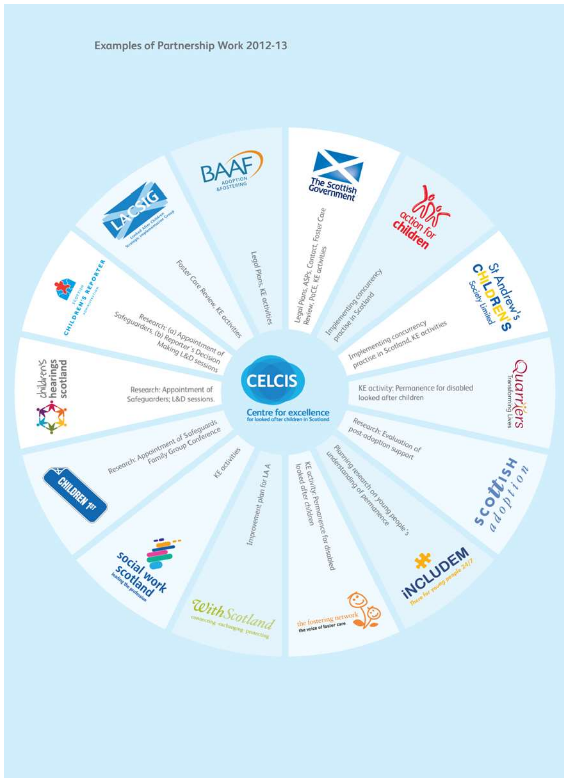
Figure 1 Examples of PaCT partnerships

work done with partners is highlighted in Figure 1; more examples are provided in the full report.