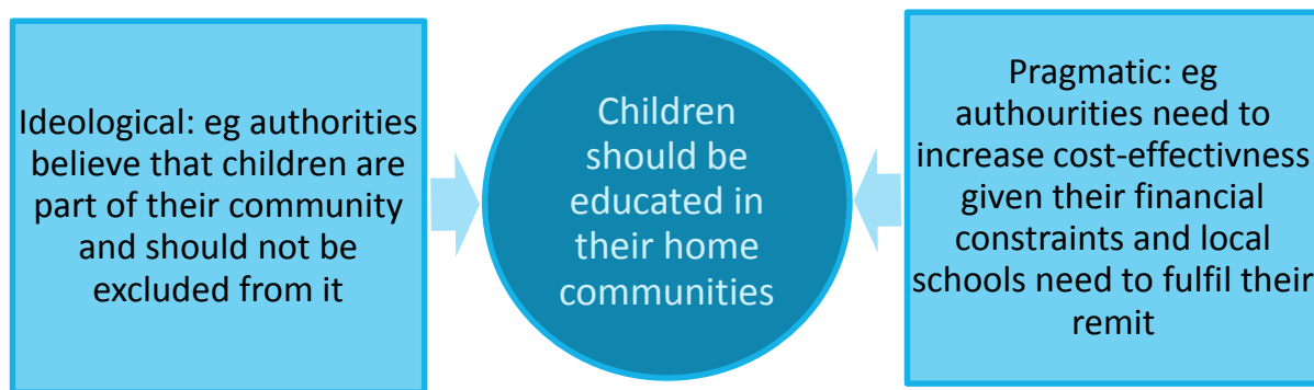
Figure 2: Local authorities' pragmatic and ideological drivers for why children should be educated in their home communities

This position (ie children should be educated in their home communities whenever possible), structures and determines which factors local authorities want to see reflected by the work of the project; some of these are shown in Figure 3: