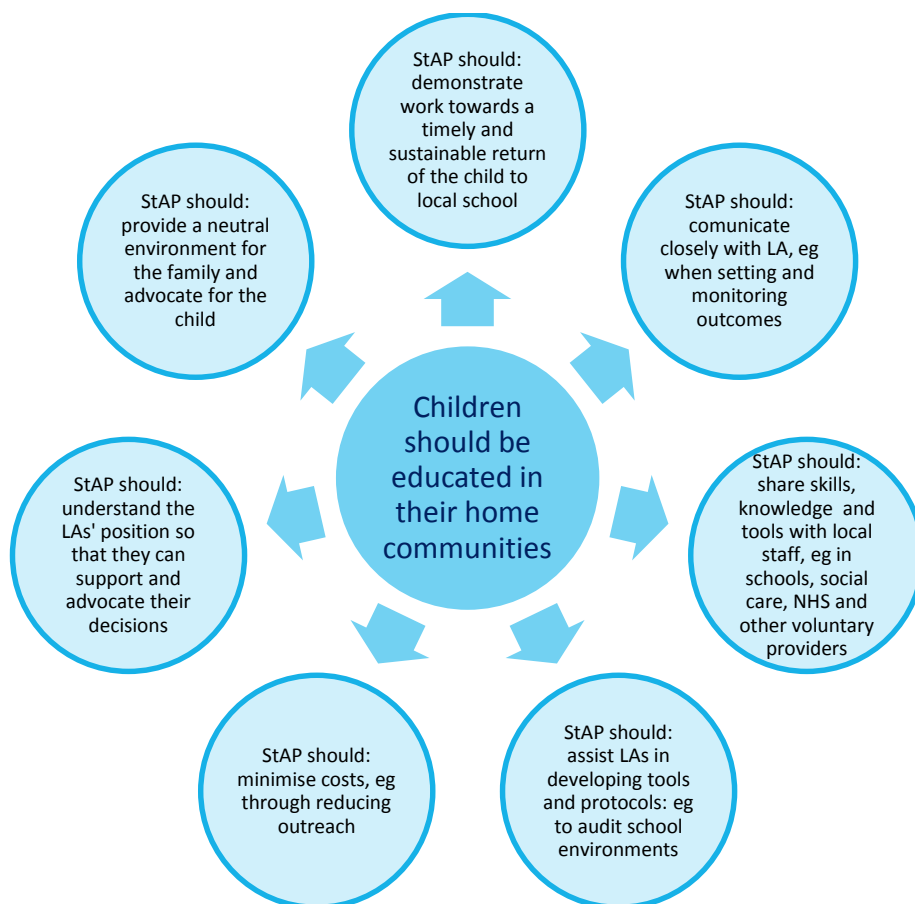
Figure 3: What local authorities want from the project

This position (ie children should be educated in their home communities whenever possible), structures and determines which factors local authorities want to see reflected by the work of the project; some of these are shown in Figure 3: