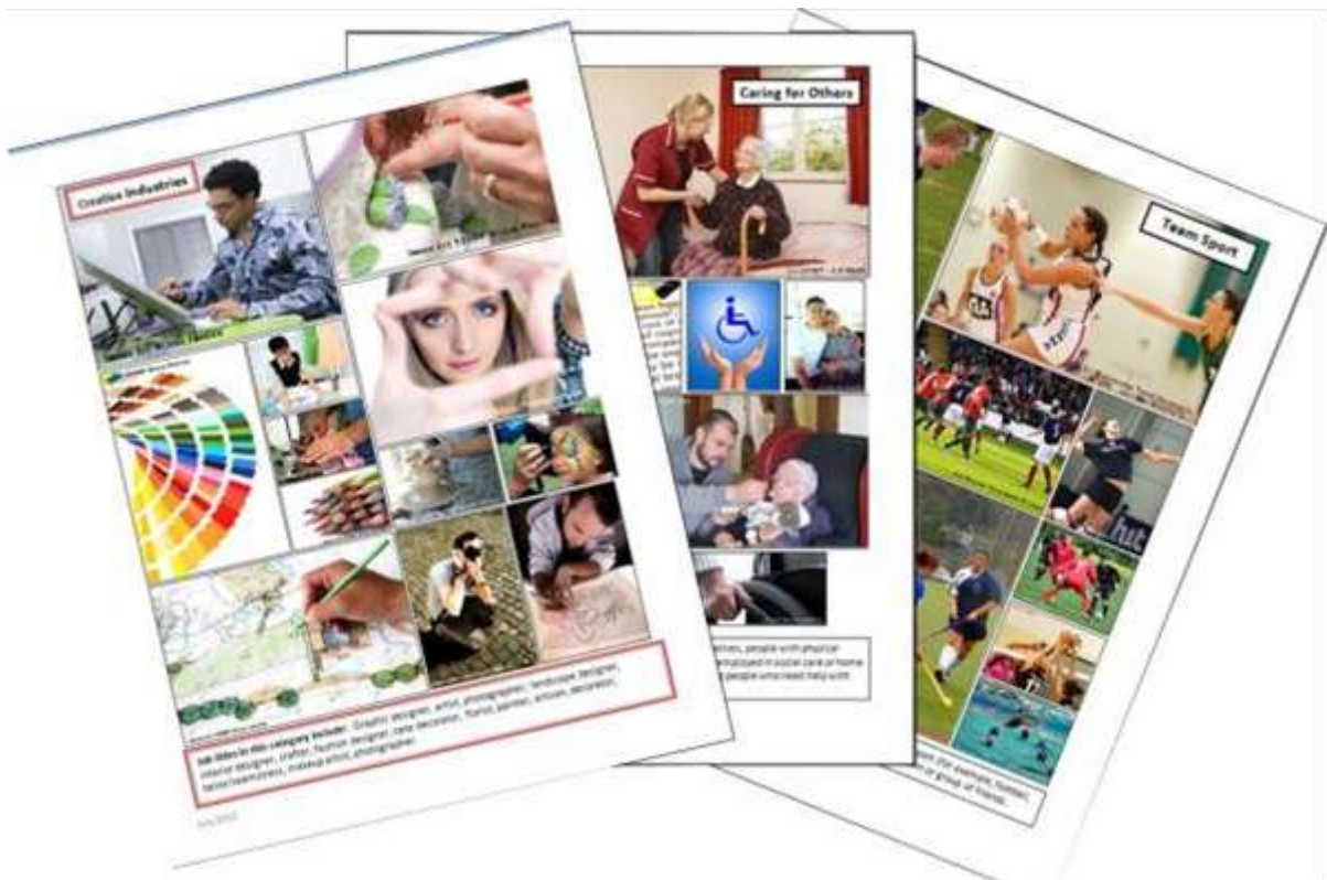
Figure 2a: The Front of the 'About Me' Cards reproduced from the toolkit.

The level descriptors for the skill area 'Being Responsible and Working with Others' are shown in Figure 3. A mind map can be used if the young person prefers this approach. 'Being Responsible and Working with Others' is used as the benchmarking skill, since it is very relevant for young people at periods of transition between school and work/ further education.